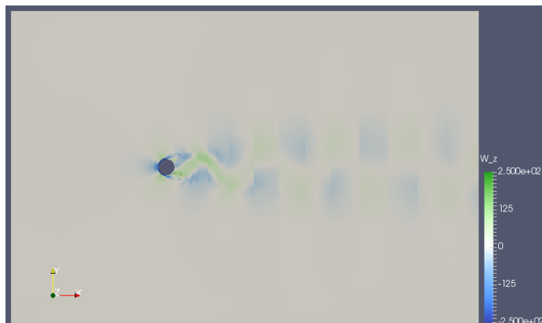
Figure 4.2 Instantaneous Vorticity Flow Field

$NEK/FieldConvert -m vorticity CylinderSubsonic_NS.xml CylinderSubsonic_NS.fld CylinderSubsonic_NS_vort.fld